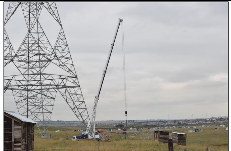
Figure 3: Crane assisting with tower erection.