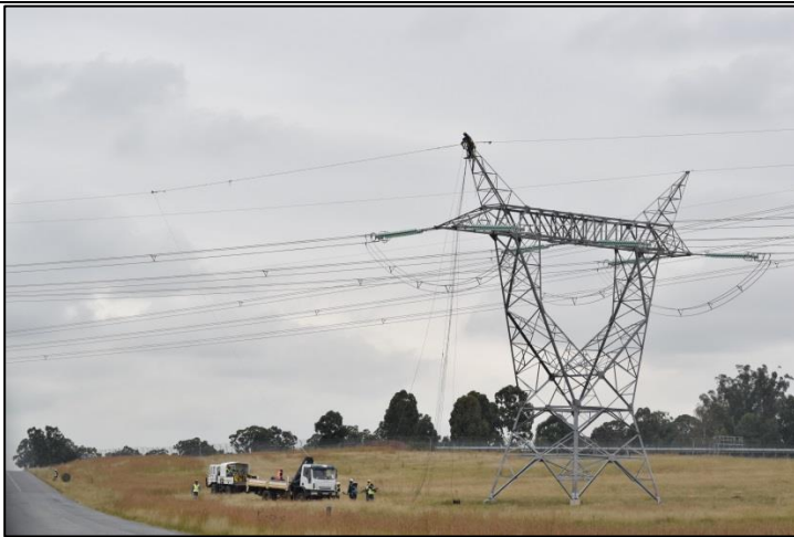
Figure 2: Stringing activities

The following table presents examples of some of the site activities and observations