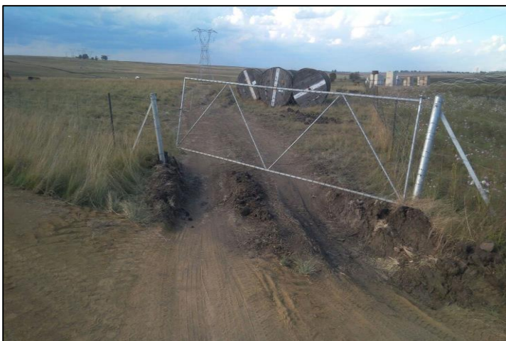
Figure 4: Damage gate on one of the farms